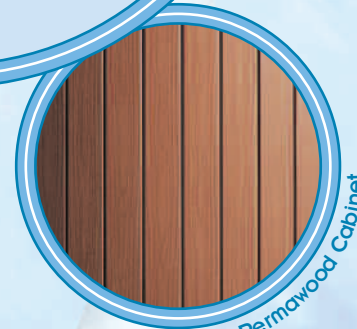
Teak PermaWood Cabinet