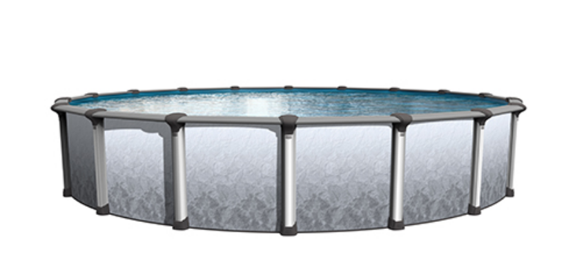
Alexander Round Above-Ground Pool

See Additional Information Above for More Details