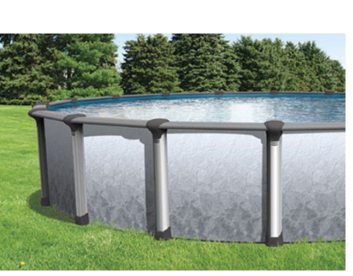
Alexander Steel Above-Ground Pool in Backyard Setting